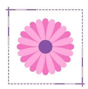
How Can We Comfort Those Who are III?