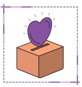
What is a Philanthropist?