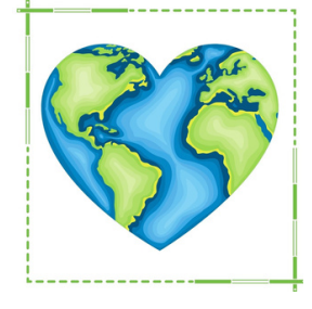
How Can We Protect the Earth?