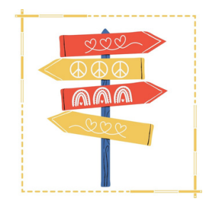
How Can We Build a Welcoming Community?