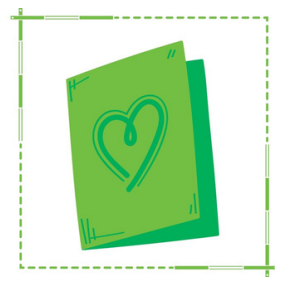
How Can We Comfort the Lonely?