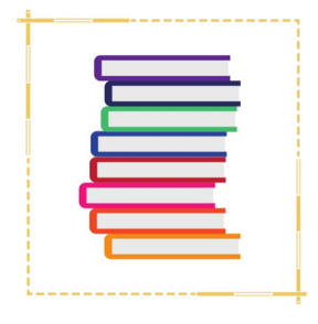
How Can We Celebrate Diverse Stories?